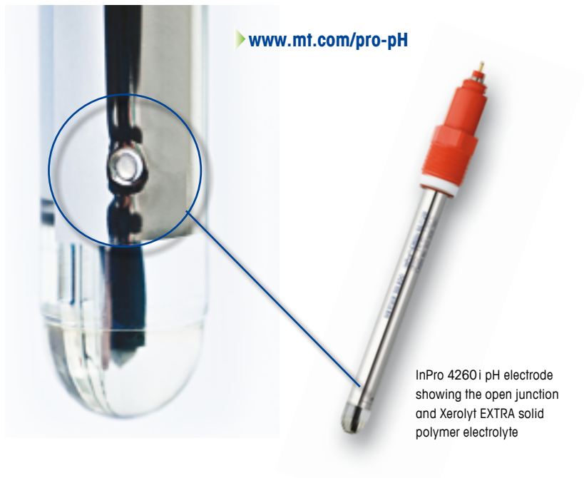
InPro 4260 i pH electrode showing the open junction and Xerolyt EXTRA solid polymer electrolyte

An in-line pH measurement solution from METTLER TOLEDO will not only verify that the amine sweetening process is doing its job, it will ensure that steam and energy at the stripper is not being wasted or that fresh amine is being misapplied.